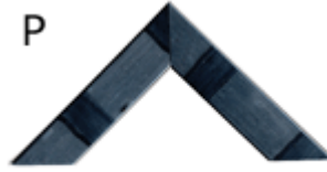
39mm Flat Tech Black