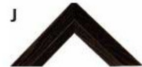
35mm round black wood