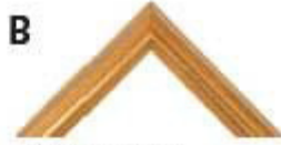
28mm wide gold