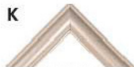
32mm Rounded silver wood