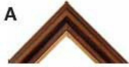
35mm wide wood/gold inlay