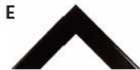
27mm wide black edge