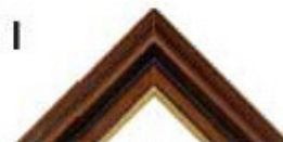
48mm wide wood/gold gilt edge inlay