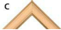
32mm round light wood gold edge