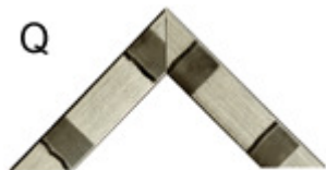
39 mm Flat Tech Gun Metal