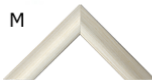
38mm Raised Brushed Cream