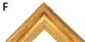
70mm wide gold