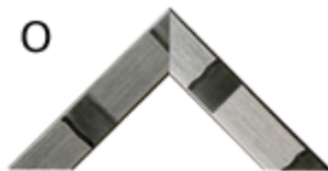
39mm Flat Tech Silver