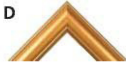
32mm round gold gilt edge