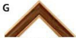
32mm round dark brown